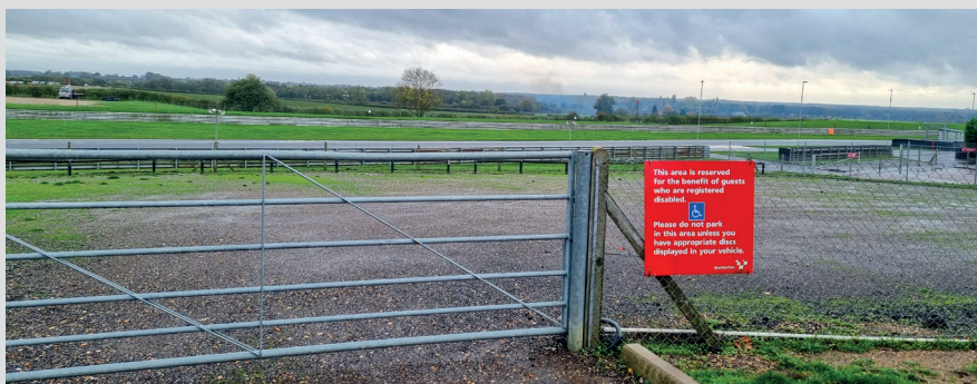
Hard surface parking located at Murrays

There is usually adequate parking within the designated disabled parking area, however if you are directed to the overflow car park, please be aware temporary toilets nearby will not be available.